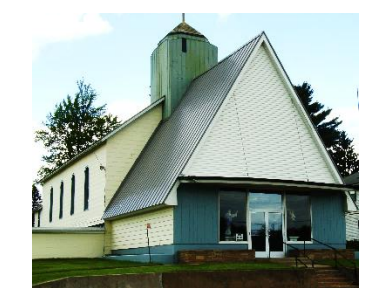
Sacred Heart of Jesus S W778 County Road N Aurora, WI 54151 P.O. Box 235 St. Anthony office hours 9am-12noon on Thursday Website: www.stanthonyniagara.org