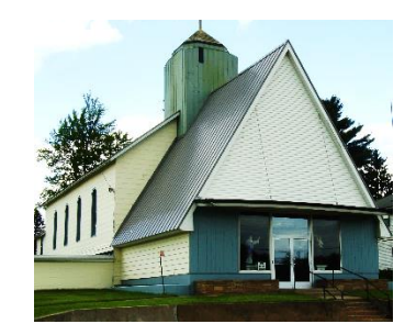
Sacred Heart of Jesus

W778 County Road N Aurora, WI 54151 P.O. Box 235 St. Anthony office hours 9am-12noon on Thursday