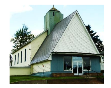
Sacred Heart of Jesus

W778 County Road N Aurora, WI 54151 P.O. Box 235 St. Anthony office hours 9am-12noon on Thursday